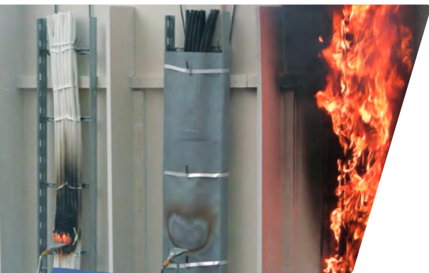
Fire testing of cable trays (from left to right): Coated with PYRO-SAFE® FLAMMOTECT-A, wrapped with PYRO-SAFE® DG-CR 0.7, unprotected cables

As cable structures vary, a multitude of different materials and material compositions come together. Many insulations and cable sheaths are combustible. In case of fire, electrical cables and cable support structures may propagate flames and smoke, leading to uncontrolled spreading like a wildfire. The heat-induced melting of plastic-sheathed cables causes burning dripping to occur and is accompanied by a release of toxic and corrosive fire gases that can lead not only to the destruction of technical systems and other materials, but also to life-threatening flue gas poisoning.